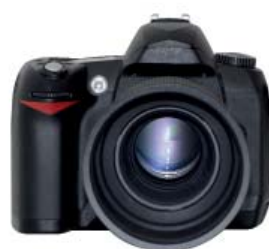
Photo service available